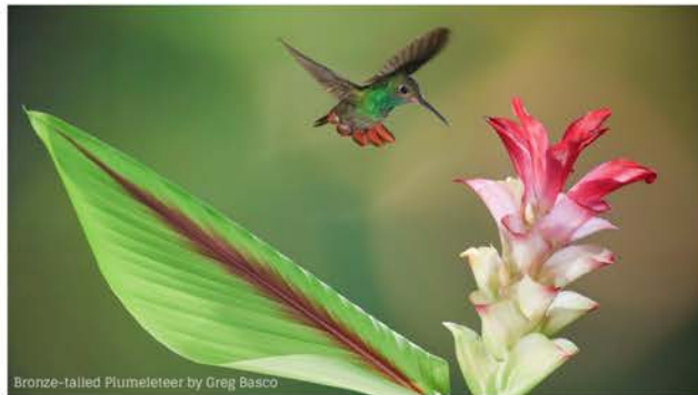
Bronze-tailed Plumeleteer by Greg Basco

Long Key Natural Area Birding with Phoebes Birding | Sunday, March 27, 9-11:30am